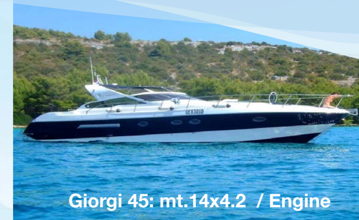
Giorgi 45: mt.14x4.2 / Engine

PROGRAM: meeting at 13:00 am at the pier, Columbus Yatching club in Trapani. Departure at 13:30 for Marettimo. Cruising between the coves. Lunch at guest's time choise. Return before the sunset.